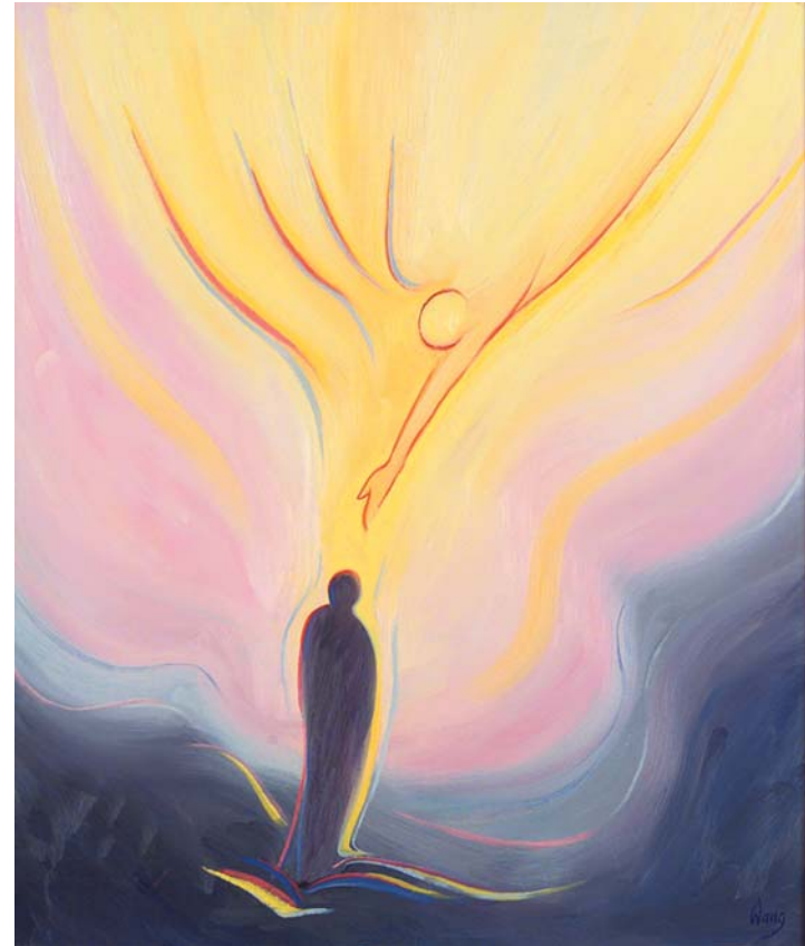
Illustration by Elizabeth Wang, 'Through the Touch of the Holy Spirit', copyright (c) Radiant Light 2004. All rights reserved. www.radiantlight.org.uk